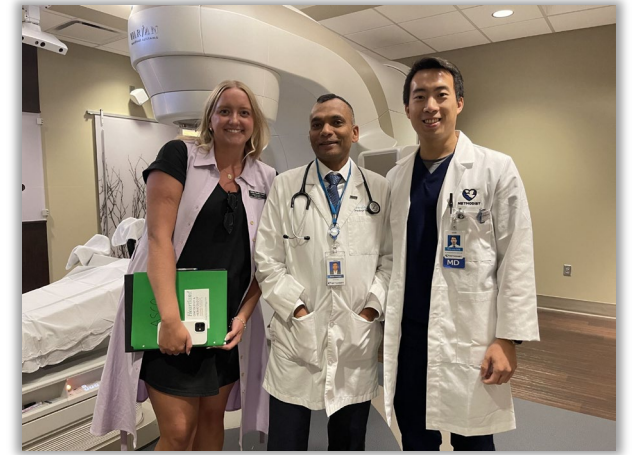
Rep. Feenstra's staff (R-IA) visiting Heartland Oncology and Hematology