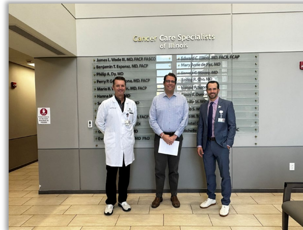
Rep. Budzinski's staff (D-IL) visiting Cancer Care Specialists of Illinois