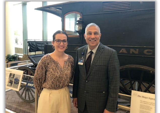
Sen. Kelly's staff (D-AZ) visiting the Mayo Clinic