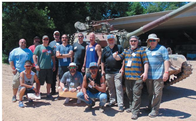
Tank Driver's Jack Event