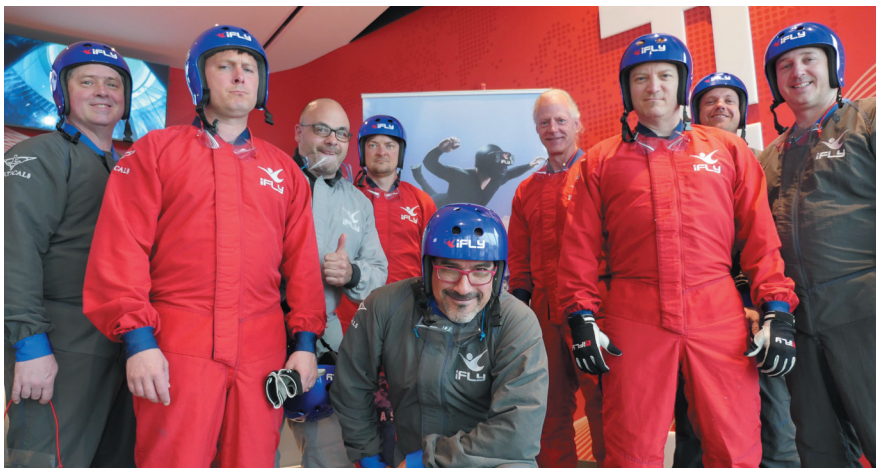
Indoor Sky Diving Jack Event