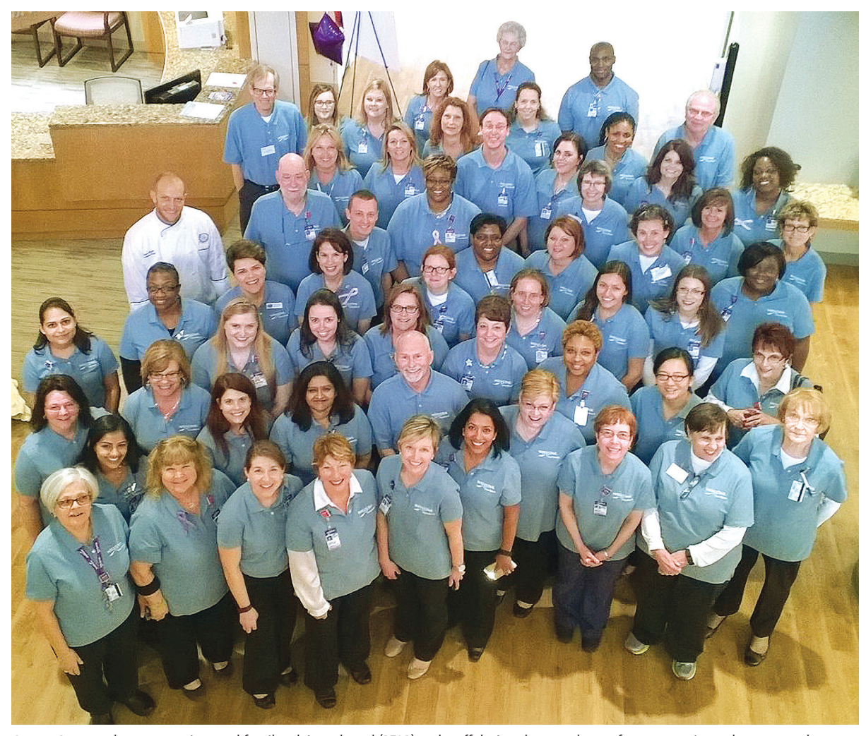
Cancer Center volunteers, patient and family advisory board (PFAB) and staff during the open house for community and team members.

staying with the person receiving treatment was a must-have.