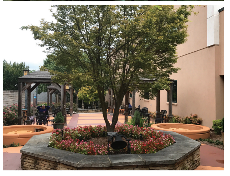
Right upper: Foyer connecting patients with the Wellness Studio, The Center for Genetics, and the Healing Arts Lobby. Right middle: The Gray Chapel which provides staff, patients and families a place for prayer and meditation. Right lower: The Garden of Courage, a beautiful outdoor space with polished brass bell that celebrates patient's strides against cancer.