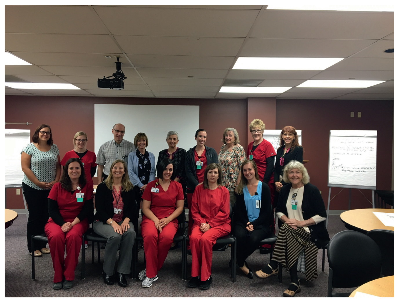
All of Me presenters with conference attendees in Mason City, Iowa.

have with patients," she says. "In the oncology setting, specifically when providing anticipatory guidance about the sexual health impacts of cancer, medical professionals need to be comfortable doing both."