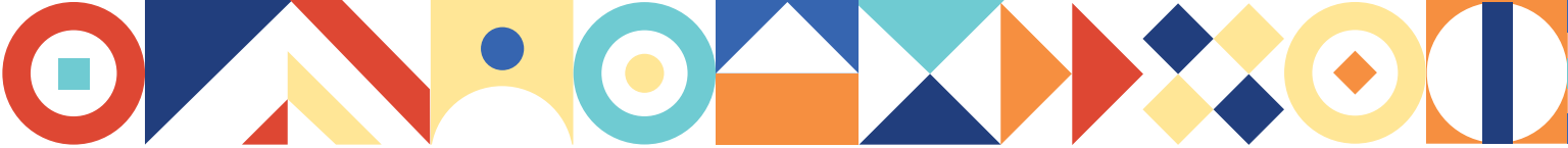
Figure 3. Beta Testing Successes, Challenges, Transferable Lessons, and Sustainability Plans