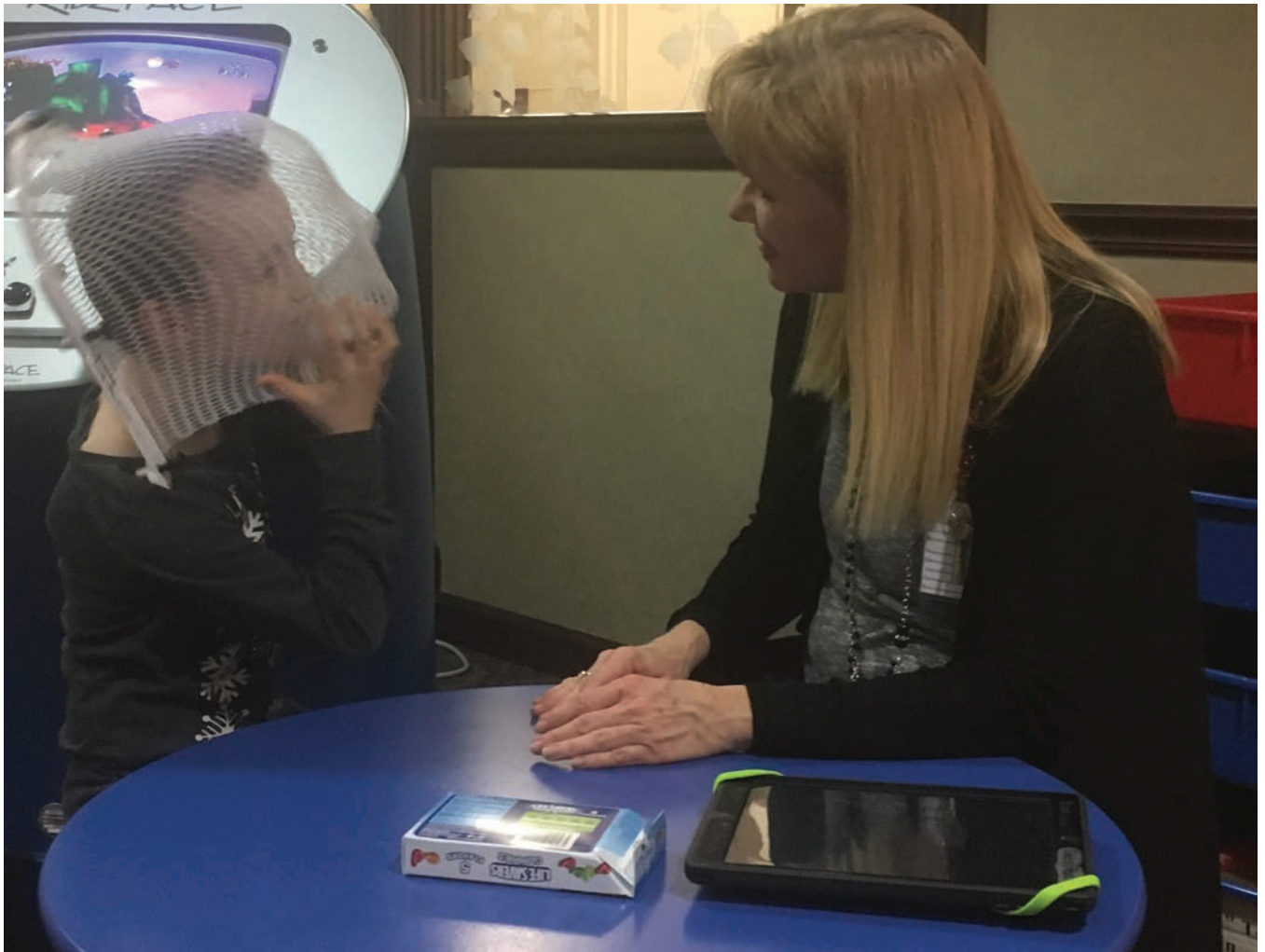
A certified child life specialist introduces a patient to the face mask, an immobilization device intended to keep patients completely still during radiation therapy.