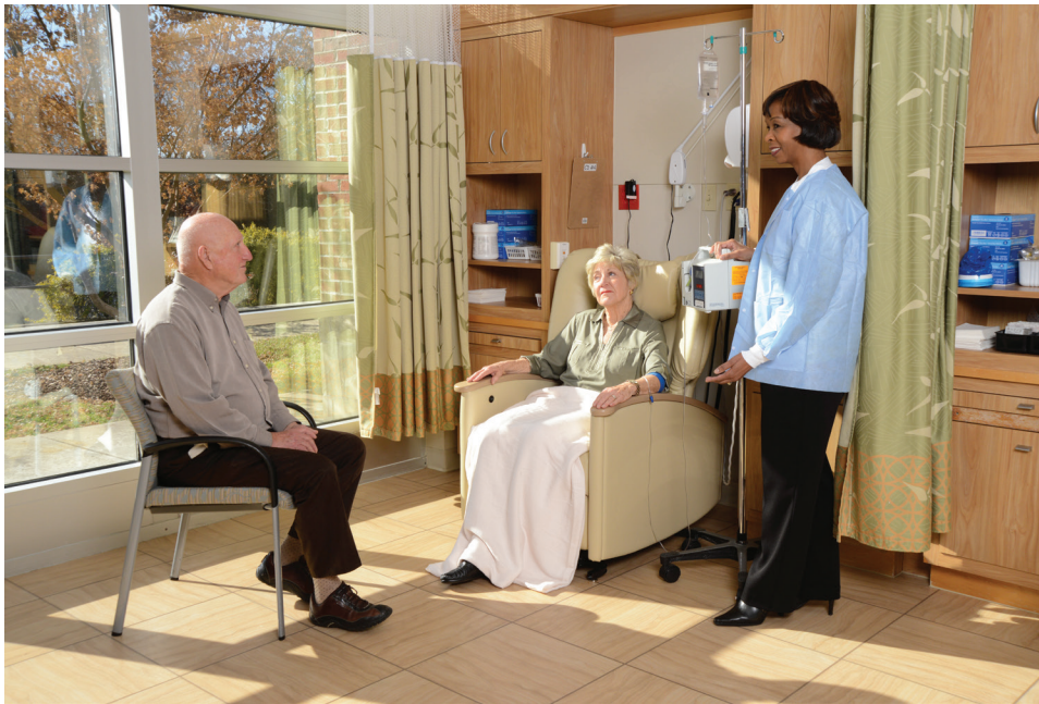
The infusion suite boasts views of a pond and floral landscaping for patients to enjoy during their treatments.