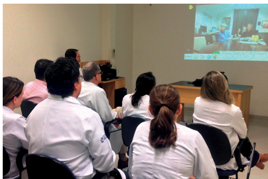
Top: Boston-based experts participating in one of the Global Cancer Institute's Global Tumor Boards. Bottom: Doctors from a developing country sit in on a Global Tumor Board.

apy, a mastectomy with axillary lymph node dissection, and four final chemotherapy cycles. After exhausting all possible alternatives, the treating oncologist presented the case to the Breast Tumor Board and the Global Cancer Institute network for guidance.