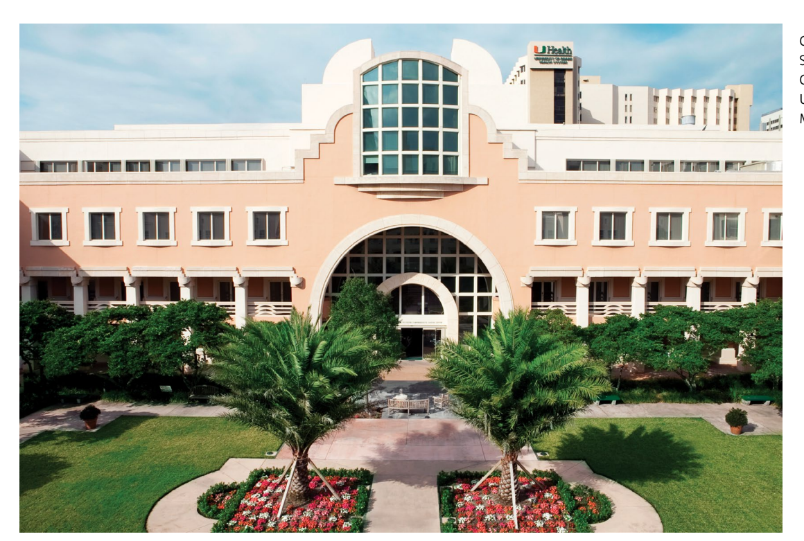
Courtyard of the Sylvester Comprehensive Cancer Center at the University of Miami, Miami, Fla.