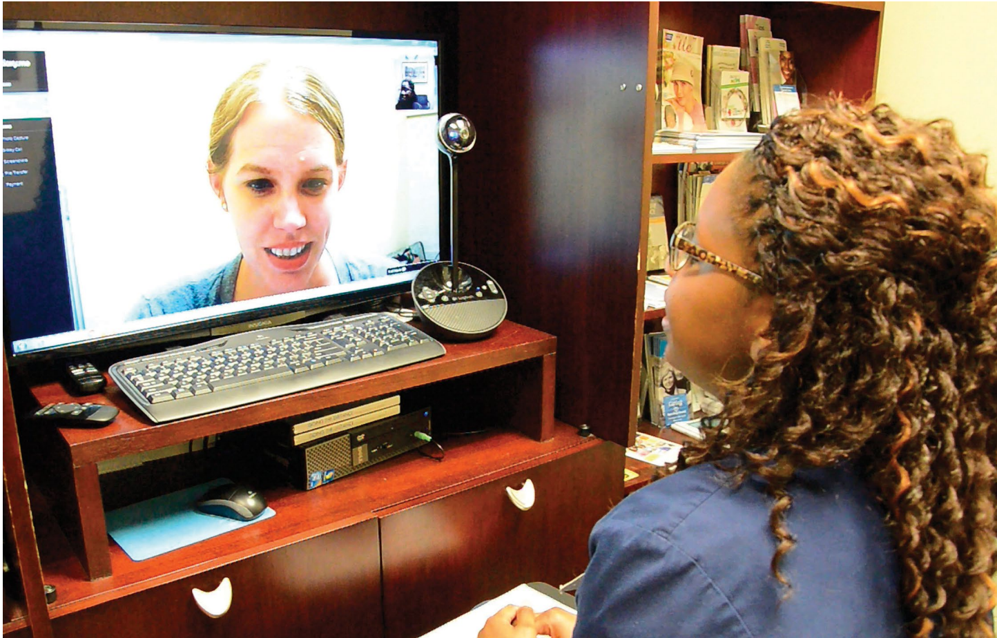
Baton Rouge General Medical Center Pennington Cancer Center's registered dietitian participates in a nutrition telehealth session.

telehealth program provides free access to patients and clinicians with secure, HIPAA-compliant data transmission for video-conferencing appointments with the registered dietitian.