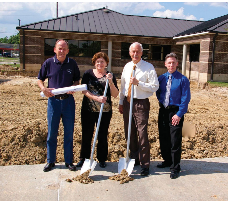
A partnership between Baton Rouge General Medical Center and Lane Regional Medical Center to build a state-of-the-art radiation oncology treatment center on Lane's campus in Zachary, La.

The first step in implementing our telehealth program: setting up a secure transmission to ensure patient privacy. Today our