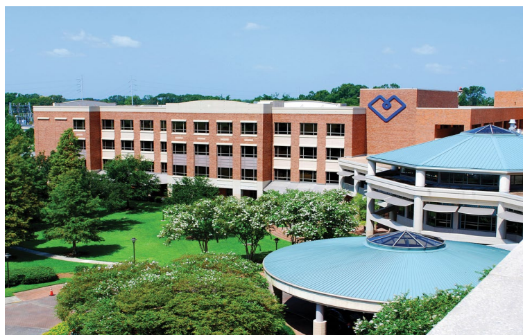
Top: Exterior shot of Baton Rouge General Medical Center's Mid-City campus. Below: Exterior shot of Baton Rouge General Medical Center's Bluebonnet campus.