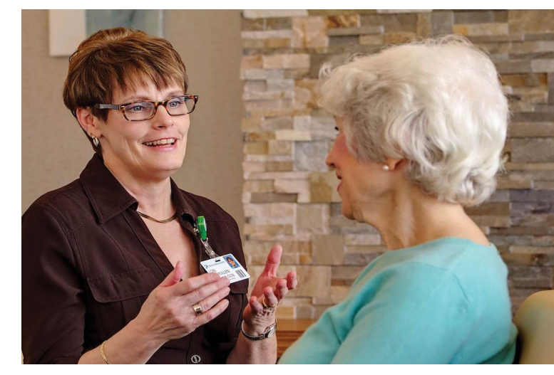
The oncology nurse navigator discusses financial resources with a patient.

One result we did not anticipate: an additional 20 percent of