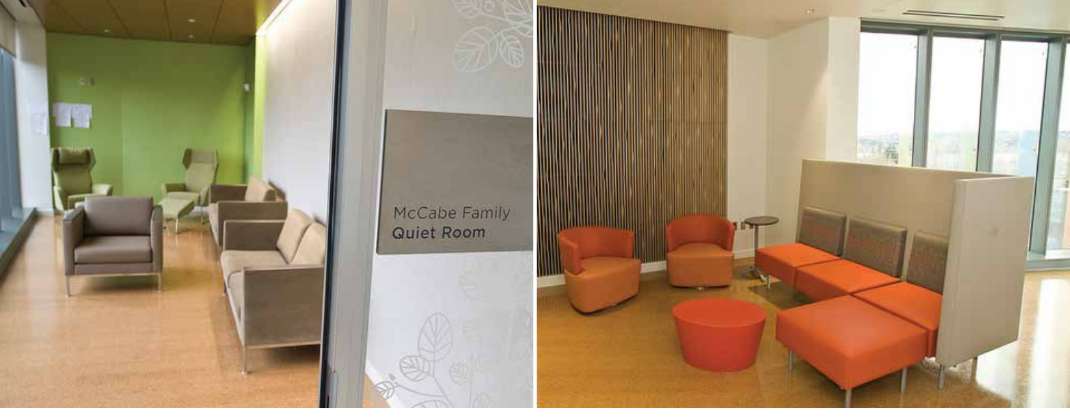
AYA quiet room