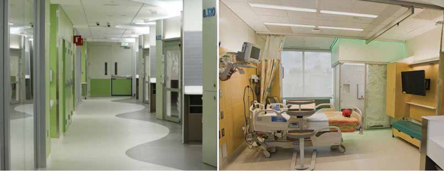
Soothing hallway in AYA Unit