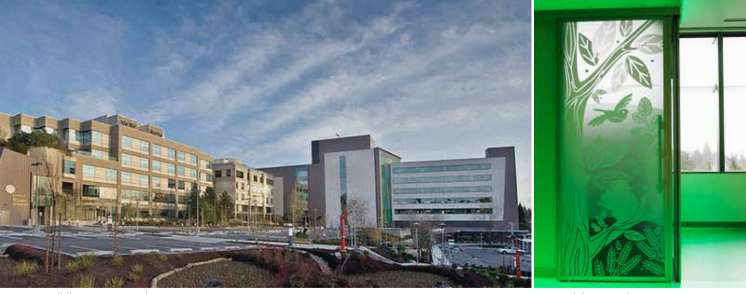
Building Hope expansion