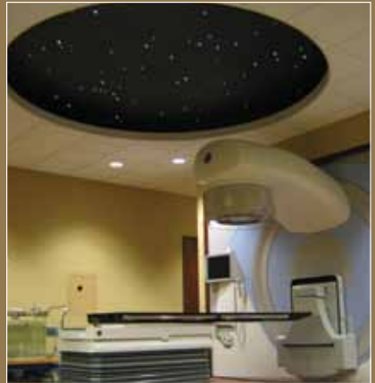
The new radiotherapy treatment suite offers patients a soothing, starry ceiling view.