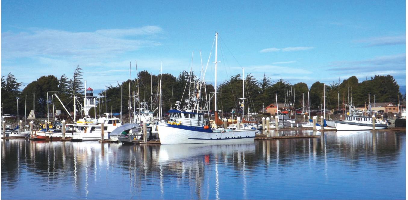
Beautiful Eureka Marina on Humboldt Bay.