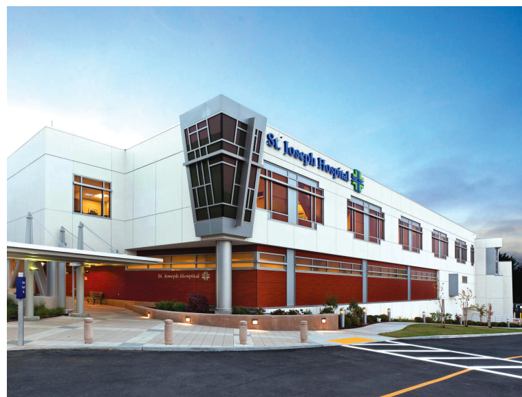
Providence St. Joseph Health Humboldt Eureka Hospital Campus.

The hospital and cancer program have both benefited substantially from the student volunteer program since its creation. For example, diversified staff allocation has been one benefit of adding volunteers to the program. The student volunteers have also had a positive effect on patient care; during the first-year