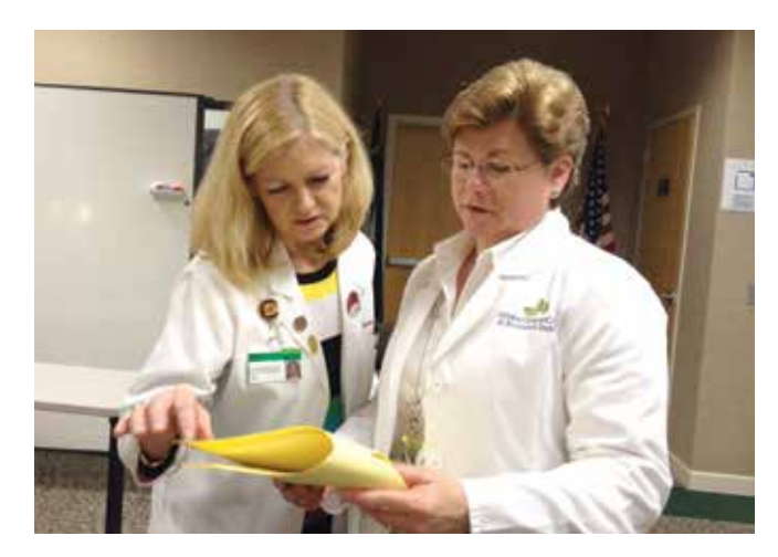
Research nurse and nurse navigator review patient cases and trial options after a MDC conference.

Figure 1. Image of Patient Navigator Data Collection Tool