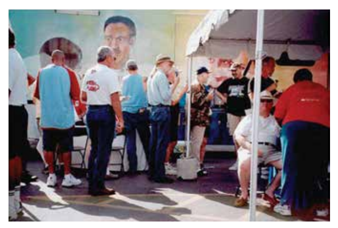
The 2006 "Cruisin' for a Cure" event provided screening and education to qualified men in the Fort Worth community.

full-service vehicle in 2000. The 40-foot mobile coach contained a mammography suite on the front end, a registration area in the middle, and an examination room in the rear. With consistent exam space and generous funding from the Kupferle Women's Health Advisory Board, a part-time family nurse practitioner was hired specifically to staff the mobile unit.