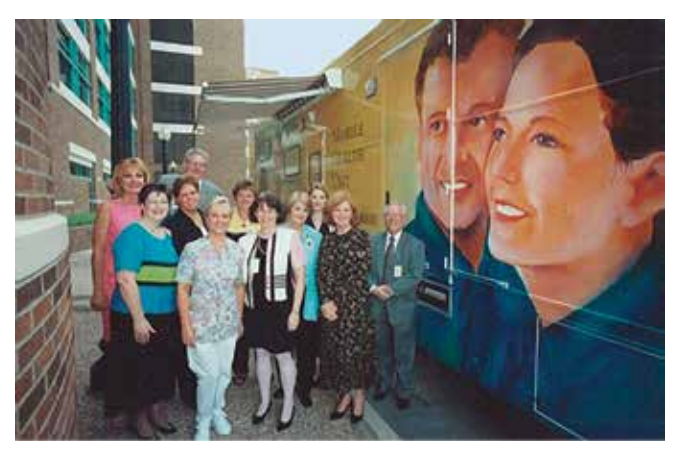
Generous funding from the Kupferle Advisory Board paid to build a full-service 40-foot mobile coach that was put into service in 2000.

The mobile health unit benefit has benefited the cancer program by creating ongoing awareness in the community of the importance of appropriate prevention and screening for a variety of cancers. The program has also increased the visibility of the hospital's commitment to quality cancer care in Fort Worth and surrounding